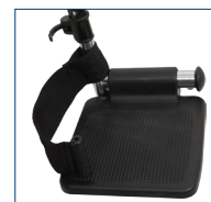
Front riggings with heel loop