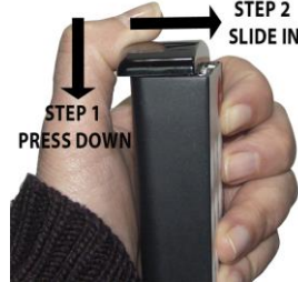
Photo C Close with keypad facing away from you

Optional screw for the battery compartment is in bag with remote