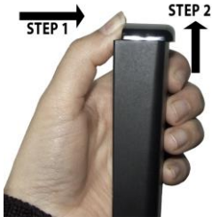
Photo A Open with keypad facing you